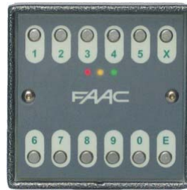
RESIST T SA