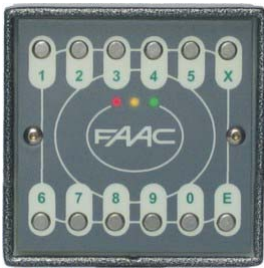
RESIST TPS SA