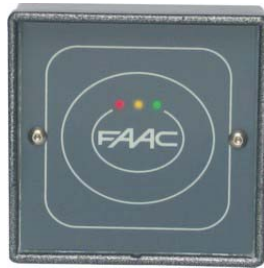
RESIST PS SA