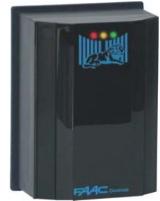
TAG 10 SA